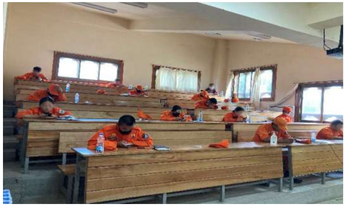
Figure 3b. Knowledge assessment