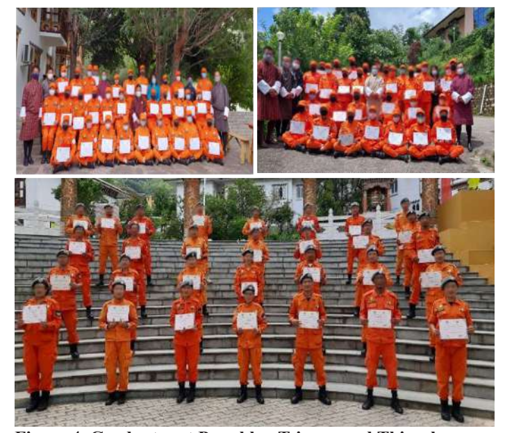
Figure 4. Graduates at Punakha, Tsirang and Thimphu

A total of 560 De-suups and 144 non-De-suups in 15 districts were provided with basic frontline workers for COVID-19 then De-suup plus training from May, 2020 – Feb 2022.